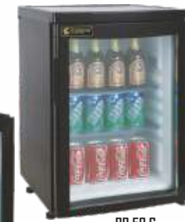
RB 50 G