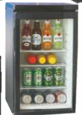
RB 60 G