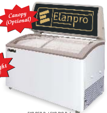
EKG 250 D / EKG 310 D / EKG 410 D / EKG 625 D