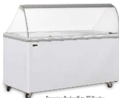
Scooping Parlor 15 to 27 Display (Available in curve & flat glass)