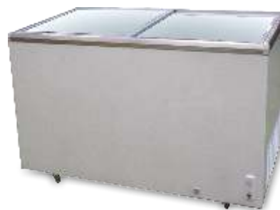
EKG 305 / EKG 405 / EKG 650