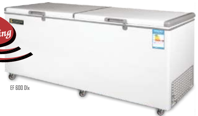
EF 600 Dlx