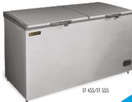
EF 455/EF 555