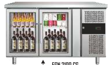
EGN 2100 CG