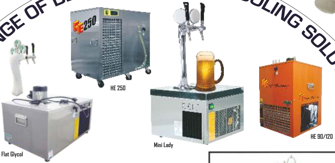
Super Flat Glycol