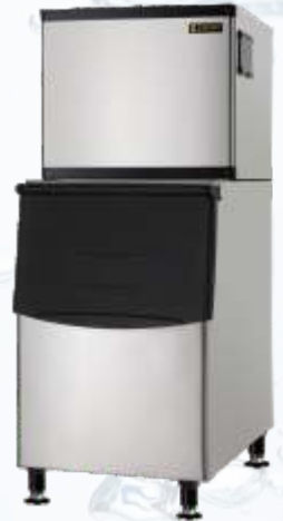
EIM 201 / EIM 351 / EIM 501