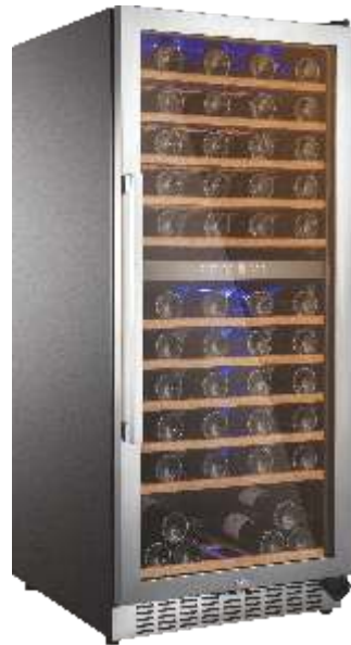
EWG 130 D