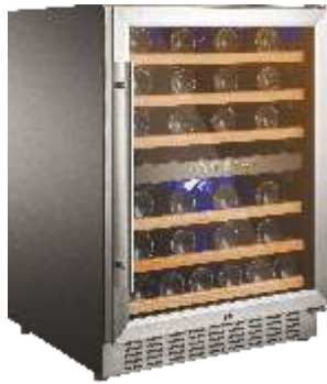
EWG 51 D