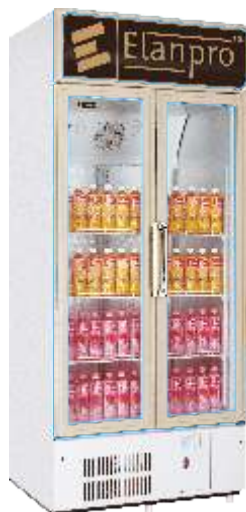
ECG 625 DD