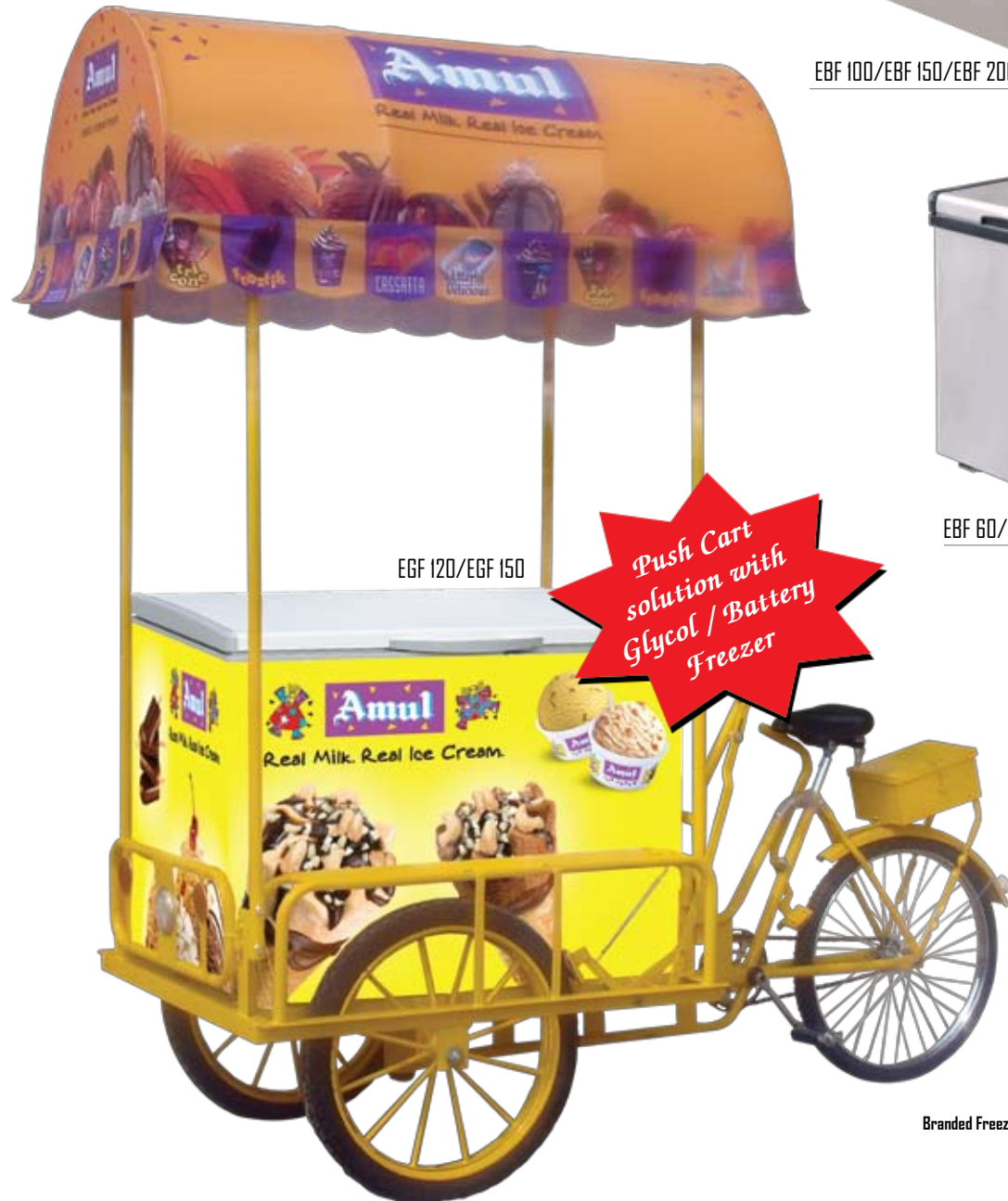
EGF 120/EGF 150

Push Cart solution with Glycol / Battery Freezer