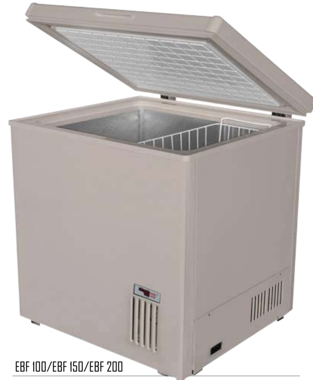
EBF 100/EBF 150/EBF 200