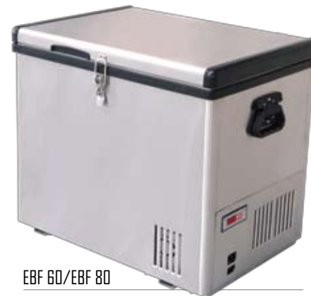
EBF 60/EBF 80