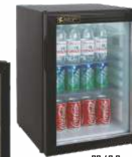
RB 40 G