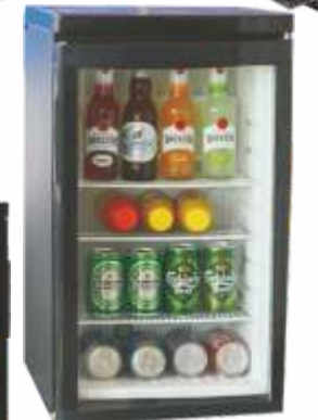
RB 60 G