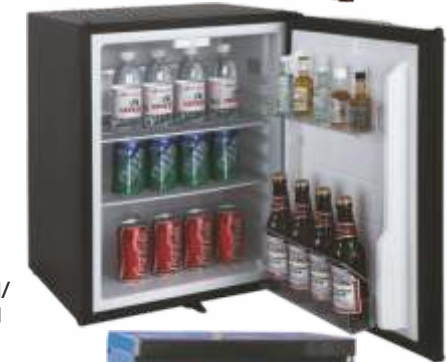
RB 50/ RB 60