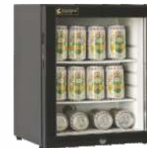
RB 30 G