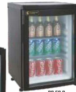
RB 50 G