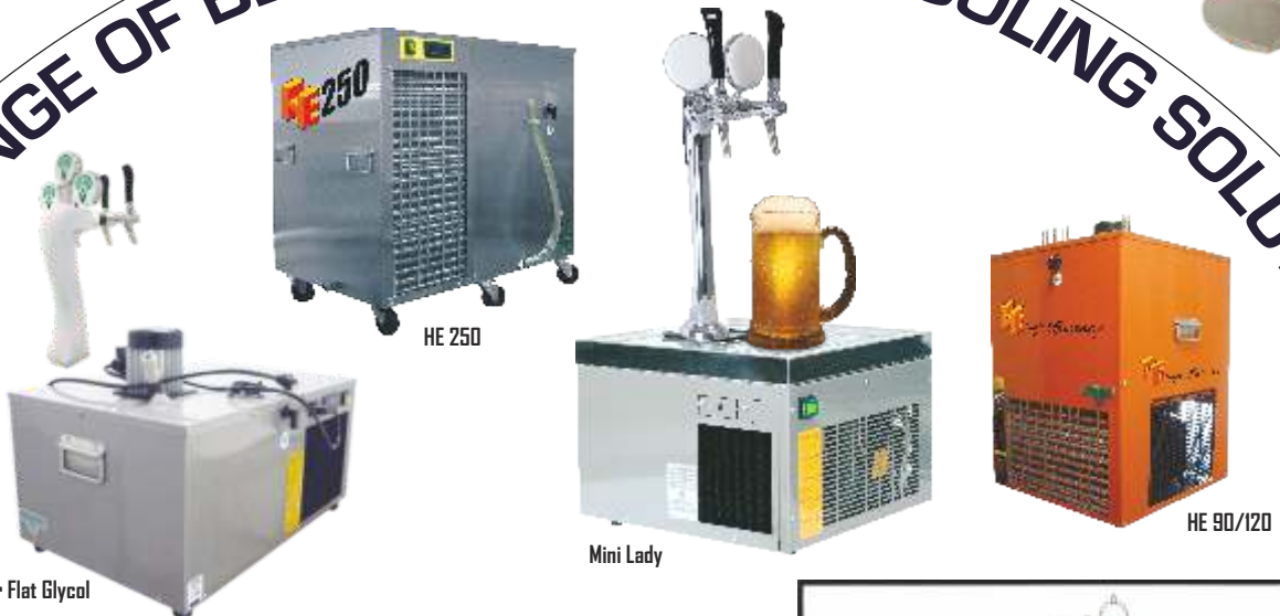
Super Flat Glycol