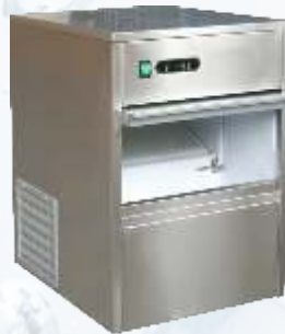
EIM 30 & EIM 50