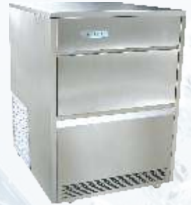
EFM 80 (Flaker)