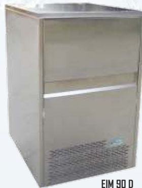
EIM 90 D